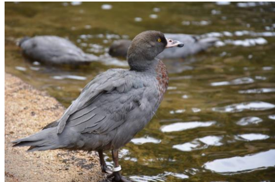
Whio/Blue duck after their release into Falls River

feeders. There has been successful breeding this season which is a wonderful sign they will thrive in the ATNP!