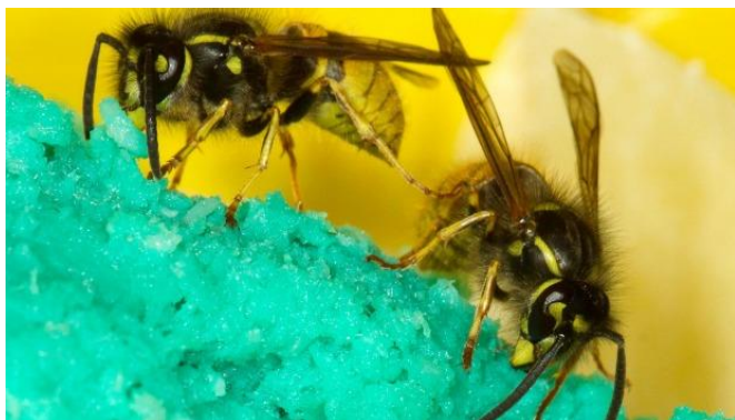
Wasps taking the bait!

In February, the threshold was reached to begin our 2019 'Wasp Wipeout' control programme.