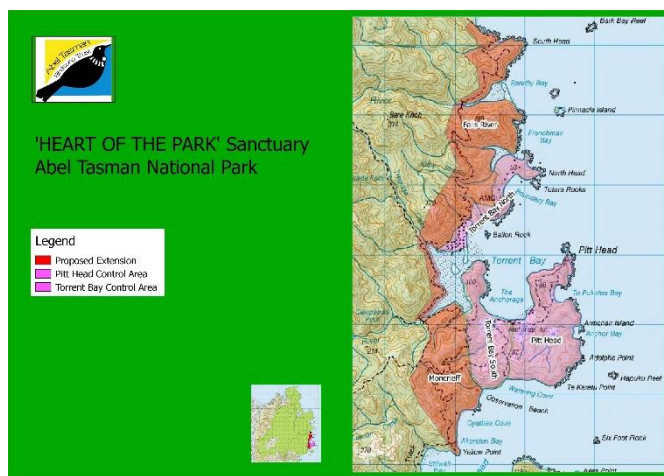
Existing and proposed A24 coverage for the 'Heart of the Park' project

We currently have contractors in cutting new lines for this comprehensive coverage and volunteers are installing traps.