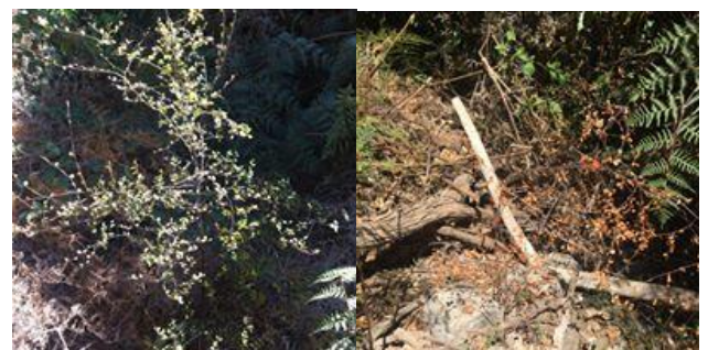
A healthy watered beech (L) and one that was missed (R)

The recent dry weather wasn't kind to many of the trees we planted last year along the edges of the coastal track up to, and around, the Tinline area. This project's focus is to enhance the visitor experience in the ATNP and provide excellent habitat for our native birds. We've been watering as much as possible and fortunately this means survival has been better than expected in these dry conditions.