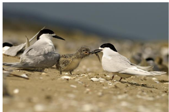
Tara/white fronted terns

Great news! A flock of around 400 tara/white fronted terns have been spotted on the Awaroa Spit. It has been 13-15 years since this species nested in this location so it's a sign of good ecosystem health. We are so pleased we now trap in this area offering extra protection for these precious birds