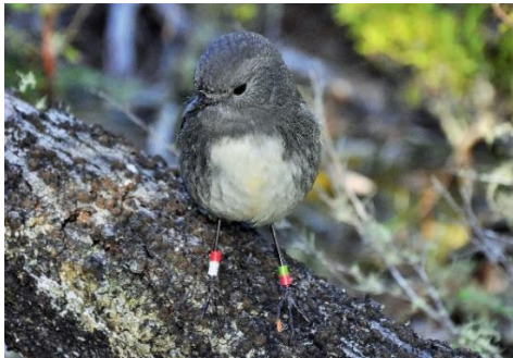
A thankful South Island Robin/Toutouwai

We currently manage a network of 541 stoat boxes and 475 self re-setting A24 traps to protect our precious native wildlife. We have caught 263 mustelids and 3,853 rats since thorough records began in 2010. This isn't counting the animals killed by the A24's which don't have a 'body count' so it's fair to say the total will be much higher than that! The trapping graphic in Appendix 1 is a great representation of the predator control effort currently occurring throughout the Abel Tasman National Park (ATNP).