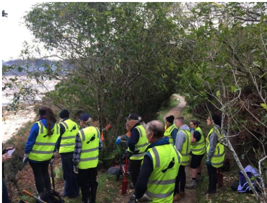
Volunteers receive planting instructions

We have had two very successful planting days this year. We planted another 500 trees in pockets cut into the bracken along the trackside towards Tinline creek. These trees will improve the food source for birds as well as improve the visitor experience in the park. Thanks to Abel Tasman Tree Collective and Trees that Count for donating all the trees this year.