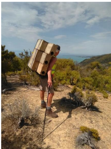
The view from the ridge running inland from Yellow Point.

We will have completed the establishment of our 'Heart of the Park' project. A total of 565 hectares of coastal bush habitat is protected offering refuge for our native birds.