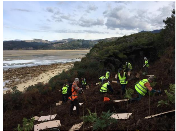
Planting with a view

Thanks also to Abel Tasman Charters for their amazing effort getting everything prepared for us, and their donation of water crystals, fertiliser tablets, sleeves and stakes.