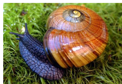
A Powelliphanta snail

We have recently taken over the management of some of the front country traplines in the Canaan Downs area. As well as protecting Toutouwai/South Island Robin, these traps protect isolated populations of our endangered Powelliphanta and Rhytida giant land snails that live in this part of the Abel Tasman. Native land snails are very distinct and need quite specific monitoring and protection. We're proud to be able to support Project Janszoon with this work. A wonderful video has been produced to explain more about the project.