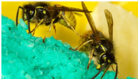
Wasps taking the bait!

In February we were planning to undertake our annual 'Wasp Wipeout' campaign. However, monitoring along the coast didn't reach the required trigger levels so no control was initiated. We have all the supplies on hand for next year and want to thank the Tasman Environment Trust for their support.