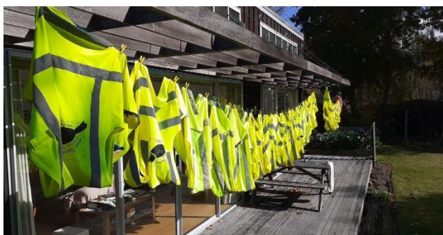
Our vests drying in preparation for the return to Level 2

To ensure the health and safety of our volunteers we had to make some changes to the way we operate. The biggest change was minimising the communal use of gear. Teams have now been allocated their own trapping kits and vests and have to follow strict safety procedures when visiting the gear sheds for essential supplies. After a few hiccups the system seems to be working well.