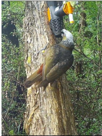
A Kākā investigating an A24

The black grill the bird is tugging on is a 'parrot excluder'. These are fitted specifically to keep these precious manu safe from the kill mechanism. Looking at this we're pretty glad to have them installed on all of our A24 traps!