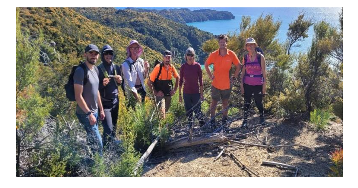
Some great views from the site.

In 2011 we started a large pine control programme in the Abel Tasman. There still are dead spars visible on the skyline from this early control. The focus has moved from the coning trees to the seedlings (which are plentiful!) and we now have a dedicated group of volunteers tackling the problem in the more accessible Stillwell area. We are undertaking this work with the support of DOC who have taken over the wider programme.